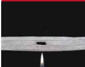
Heat-flame resilience test