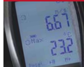
Experience a higher rate of airflow with genuine air con filters