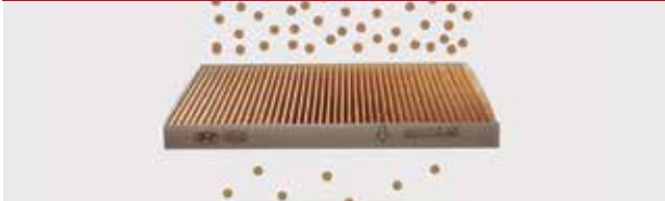
Illustration of air con filter with dust filtering test.