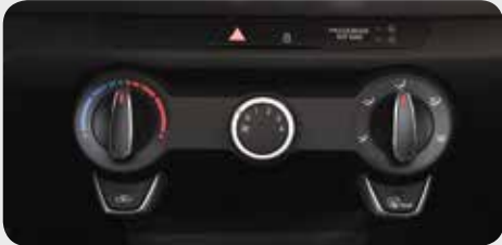
Manual A/C (EX only) The manual air conditioning includes dials for temperature, fan speed and airflow points, with more buttons for modes, defrosting and recirculation.