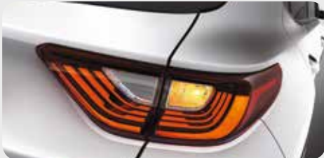
LED rear combination lamp (SX only) LED rear combination lamps illuminate instantly and give the rear a modern, high-tech appearance.