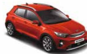
Signal Red (BEG)