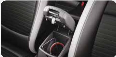
Center console armrest The comfortable armrest is coordinated with interior trim and integrated with a console that includes two cupholders and a sliding compartment.