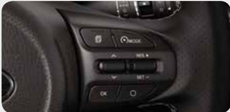
Auto Cruise Control with speed limiter (SX only) The auto cruise function can be activated using steering wheel-mounted controls, making it easy to set your desired speed.