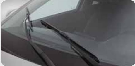
Aeroblade wipers Aerodynamic wiper blades maintain contact with the windshield, even at high speeds.