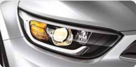
Bi-projection headlamps Bi-projection headlamps offer more precise illumination, enabling you to better detect obstacles and navigate the road ahead.