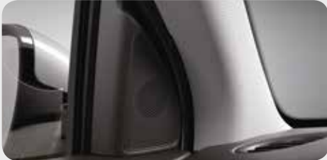
Tweeters High-quality high-range speakers are strategically positioned for clarity and balance with the other speakers.