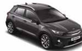
Platinum Graphite (ABT)