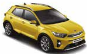
Most Yellow (MYW)