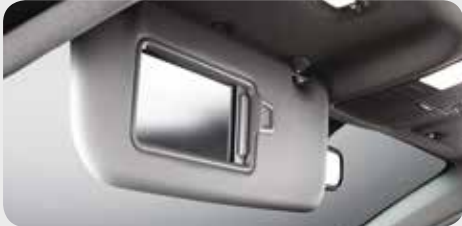
Sun visor illumination lamps Tasteful LEDs beside the vanity mirror on the driver-side sun visor light up to help with last minute touch-ups.