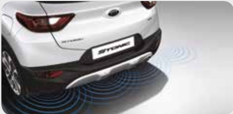
Parking Distance Warning-Reverse (PDW-R) When you back into a parking spot, audible beeps alert you of the distance to obstacles behind as you reverse.