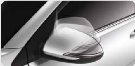
Electric folding mirrors with side repeaters The outside mirrors can be folded and unfolded conveniently with the push of a button.