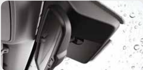
Rain sensor (SX only) When it detects raindrops on the windshield, the rain sensor activates the wipers automatically.