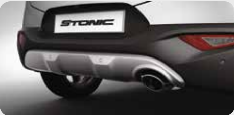
Skid plate An attractive, aerodynamically contoured skid plate below the rear bumper helps protect the body and fuel tank from scrapes.