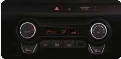
Automatic Temperature Control (SX only) Auto temperature control lets you select a desired temperature for the system to maintain. A digital readout displays temperature and settings.