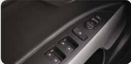
Power windows Power window controls allow passengers to control the amount of air going in and out of the car.