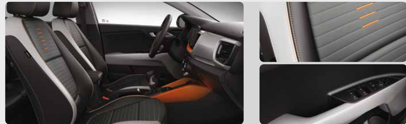
Gray Two-tone Interior (Orange PKG) - For two-tone combinations of exterior colours only.

Two-tone light and medium gray artificial leather seats feature bright green stitching. Breathable gray cloth inserts include a nailhead pattern, horizontal embroidered stripes, and green embossed accents that match the tone of the bright green trim on the dash and center console. Door armrests are a medium gray.