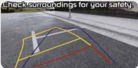
Rear parking assist system with rear view camera and dynamic guidelines The rear view camera projects dynamic, bending guidelines through the 7-inch LCD floating touchscreen to make parking a breeze.