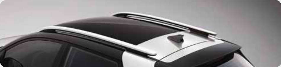
Bridge-type roof rack (SX only) Store bikes, luggage or bulky sporting goods securely on the roof to preserve interior space and protect the upholstery from soil and moisture.

Commutes? Weekend getaways? A sound chamber for music lovers? At a certain point, only you can decide what a vehicle is for and what belongs in it. The Stonic is offered with a wealth of equipment that can help make it feel like it was custom-made for you from the start.