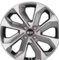
17-inch Alloy Wheel