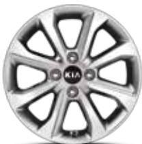
15-inch Alloy Wheel