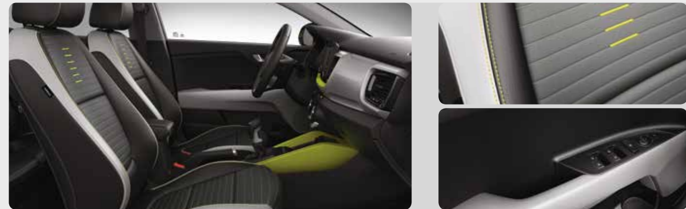
Gray Two-tone Interior (Green PKG) - For two-tone combinations of exterior colours only.

Colours can say a lot about your attitude towards life. The Stonic is available in exciting combinations of exterior colours. Refreshingly lively interior colour packages help to complete the look, with appealingly coordinated seat stitching, embroidered seat-back patterns, and dash and console trim elements.