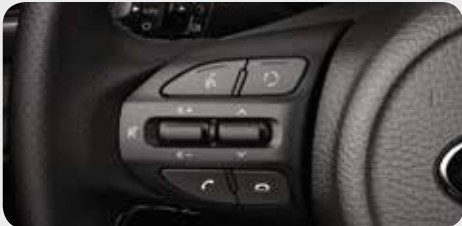
Steering wheel audio remote Adjust audio settings using just your thumb for enhanced driving safety.