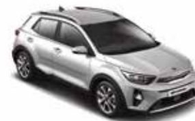
Silky Silver (4SS)