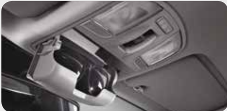
Sunglasses storage with overhead console lamp An overhead console helps you stay organised.