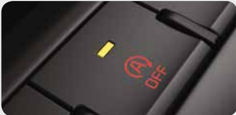
ISG (Idle Stop & Go) When enabled, ISG allows the engine to shut off when idle, improving fuel efficiency and reducing emissions.