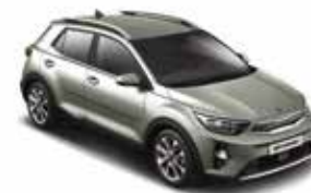
Urban Green (URG)