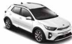
Clear White (UD)

The Stonic comes in refreshingly bold and lively colours that bring out the best in its contours. You can even make your Stonic two-tone by choosing one of the special roof-colour options.