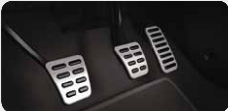
Metal pedal pads (SX only) Add an authentically sporty look and feel to the interior with metal finished pedal pads.