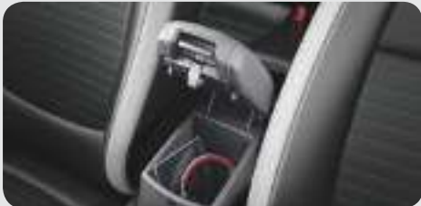
Center console armrest The comfortable armrest is coordinated with interior trim and integrated with a console that includes two cupholders and a sliding compartment.