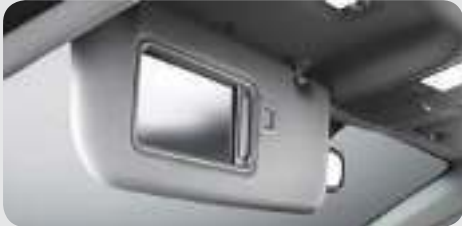
Sun visor illumination lamps Tasteful LEDs beside the vanity mirror on the driver-side sun visor light up to help with last minute touch-ups.