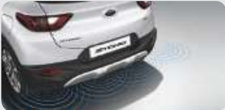
Parking Distance Warning-Reverse (PDW-R) When you back into a parking spot, audible beeps alert you of the distance to obstacles behind as you reverse.