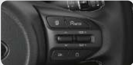
Auto Cruise Control with speed limiter (SX only) The auto cruise function can be activated using steering wheel-mounted controls, making it easy to set your desired speed.