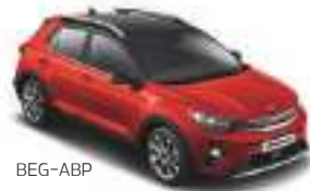
Aurora Black Pearl (ABP)