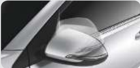
Electric folding mirrors with side repeaters The outside mirrors can be folded and unfolded conveniently with the push of a button.