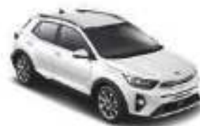
Clear White (UD)

The Stonic comes in refreshingly bold and lively colours that bring out the best in its contours. You can even make your Stonic two-tone by choosing one of the special roof-colour options.