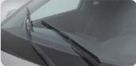
Aeroblade wipers Aerodynamic wiper blades maintain contact with the windshield, even at high speeds.