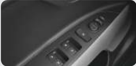
Power windows Power window controls allow passengers to control the amount of air going in and out of the car.