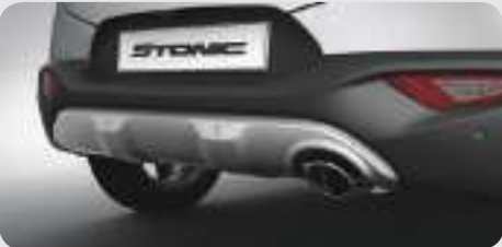
Skid plate An attractive, aerodynamically contoured skid plate below the rear bumper helps protect the body and fuel tank from scrapes.