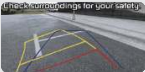
Rear parking assist system with rear view camera and dynamic guidelines The rear view camera projects dynamic, bending guidelines through the 7-inch LCD floating touchscreen to make parking a breeze.