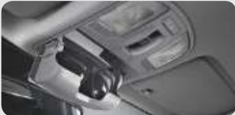
Sunglasses storage with overhead console lamp An overhead console helps you stay organised.