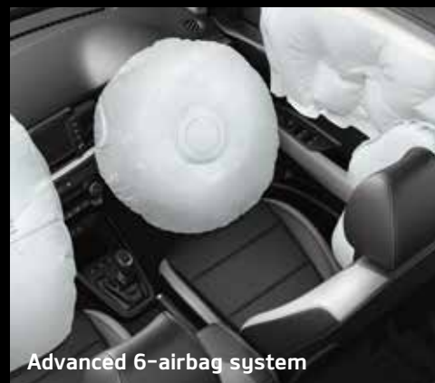
Advanced 6-airbag system