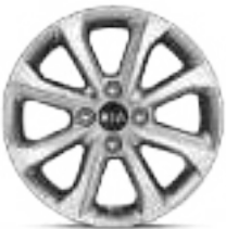
15-inch Alloy Wheel