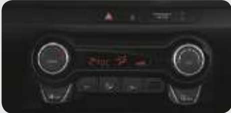
Automatic Temperature Control (SX only) Auto temperature control lets you select a desired temperature for the system to maintain. A digital readout displays temperature and settings.