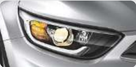
Bi-projection headlamps Bi-projection headlamps offer more precise illumination, enabling you to better detect obstacles and navigate the road ahead.