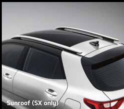
Sunroof (SX only)