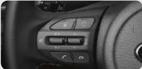
Steering wheel audio remote Adjust audio settings using just your thumb for enhanced driving safety.