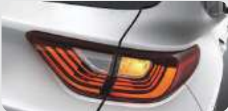
LED rear combination lamp (SX only) LED rear combination lamps illuminate instantly and give the rear a modern, high-tech appearance.