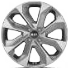
17-inch Alloy Wheel