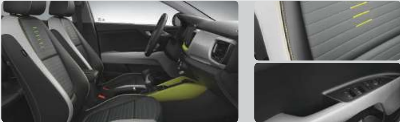
Gray Two-tone Interior (Green PKG) - For two-tone combinations of exterior colours only.

Colours can say a lot about your attitude towards life. The Stonic is available in exciting combinations of exterior colours. Refreshingly lively interior colour packages help to complete the look, with appealingly coordinated seat stitching, embroidered seat-back patterns, and dash and console trim elements.