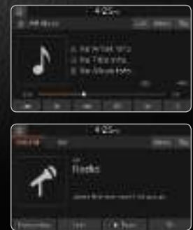
7-inch touchscreen infotainment system The 7-inch LCD floating touchscreen offers Apple CarPlay and rear camera display.