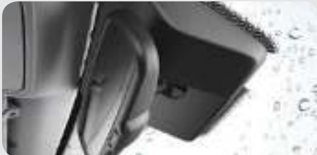
Rain sensor (SX only) When it detects raindrops on the windshield, the rain sensor activates the wipers automatically.