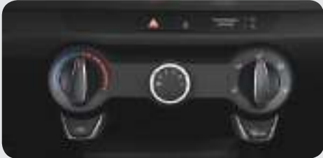
Manual A/C (EX only) The manual air conditioning includes dials for temperature, fan speed and airflow points, with more buttons for modes, defrosting and recirculation.