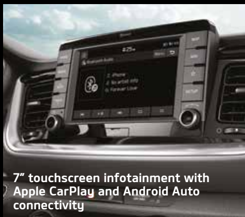
7" touchscreen infotainment with Apple CarPlay and Android Auto connectivity