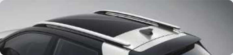
Bridge-type roof rack (SX only) Store bikes, luggage or bulky sporting goods securely on the roof to preserve interior space and protect the upholstery from soil and moisture.

Commutes? Weekend getaways? A sound chamber for music lovers? At a certain point, only you can decide what a vehicle is for and what belongs in it. The Stonic is offered with a wealth of equipment that can help make it feel like it was custom-made for you from the start.