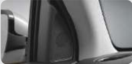
Tweeters High-quality high-range speakers are strategically positioned for clarity and balance with the other speakers.