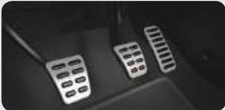
Metal pedal pads (SX only) Add an authentically sporty look and feel to the interior with metal finished pedal pads.