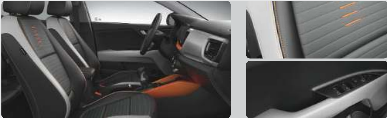
Gray Two-tone Interior (Orange PKG) - For two-tone combinations of exterior colours only.

Two-tone light and medium gray artificial leather seats feature bright green stitching. Breathable gray cloth inserts include a nailhead pattern, horizontal embroidered stripes, and green embossed accents that match the tone of the bright green trim on the dash and center console. Door armrests are a medium gray.