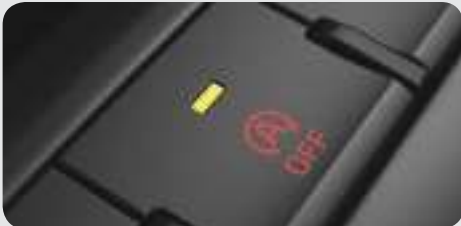
ISG (Idle Stop & Go) When enabled, ISG allows the engine to shut off when idle, improving fuel efficiency and reducing emissions.