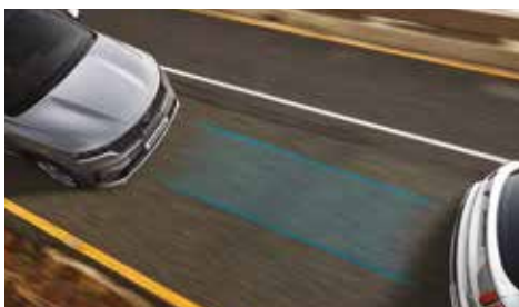
Smart Cruise Control