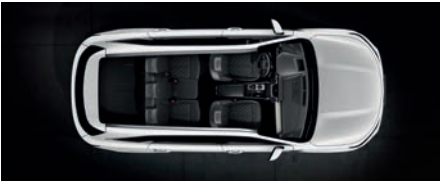
3 rd row folded fully flat (7-seater)