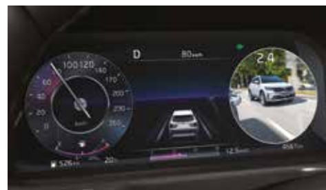
Fully Digital Supervision Cluster with Blind-spot View Monitor