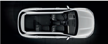
3 rd row folded fully flat and 2 nd row partially folded (7-seater)

When your head says let's push boundaries, the Sorento Hybrid says let's do it in style. That's why you'll find the ultimate in comfort, space and flexibility wrapped inside its bold exterior design.