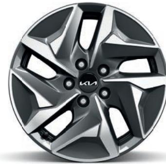
17" alloy wheel

With nine distinctive body colours and the 17" alloy wheels, there's a Sorento Hybrid waiting for you to personalize it to your taste.