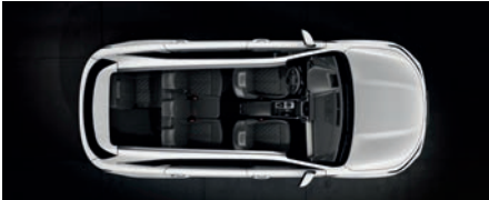
3 rd row partially folded (7-seater)