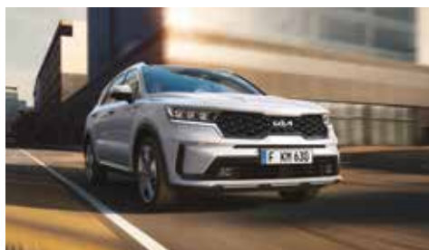
1.6L Turbocharged Hybrid