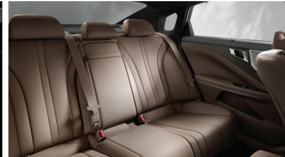
Premium leather seats Ergo Motion Seat