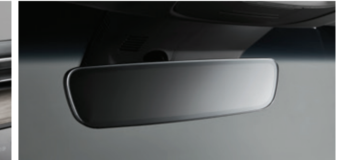
Frameless inside mirror