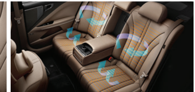
Seat ventilation/warming system (all seats)