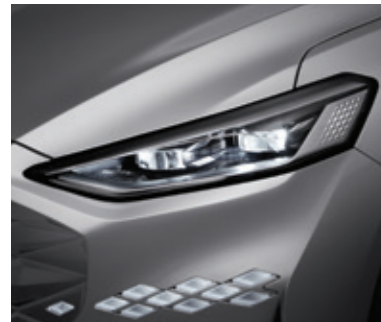
Projection LED headlamps