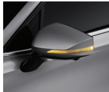
LED repeater integrated outside mirrors