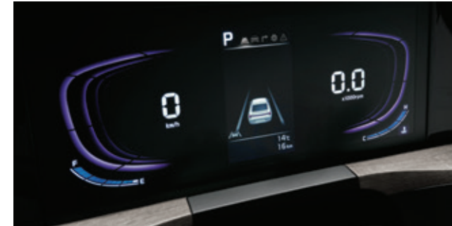
Supervision cluster (4.2-inch color TFT LCD)