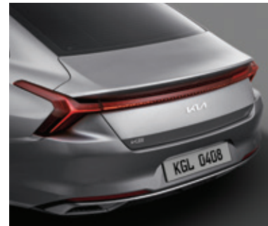
LED rear combination lamps