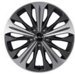
18-inch alloy wheels

Details should serve a purpose. Everything in the Kia K8 adds something to the mix. From the artful front grille to the soft suede and classic gauge faces on the inside. Some project a bold or playful image. Some just feel right. Some accomplish tasks in new and better ways. When they all come together, the Kia K8 really shines.