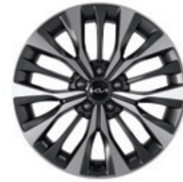
19-inch alloy wheels