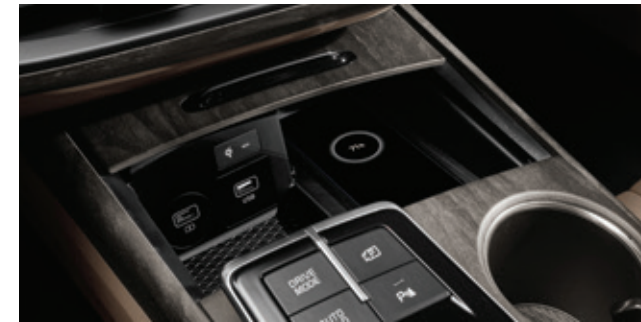
Wireless charging tray