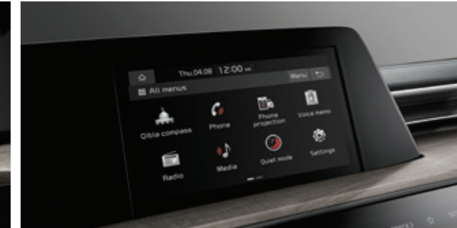
8-inch display audio