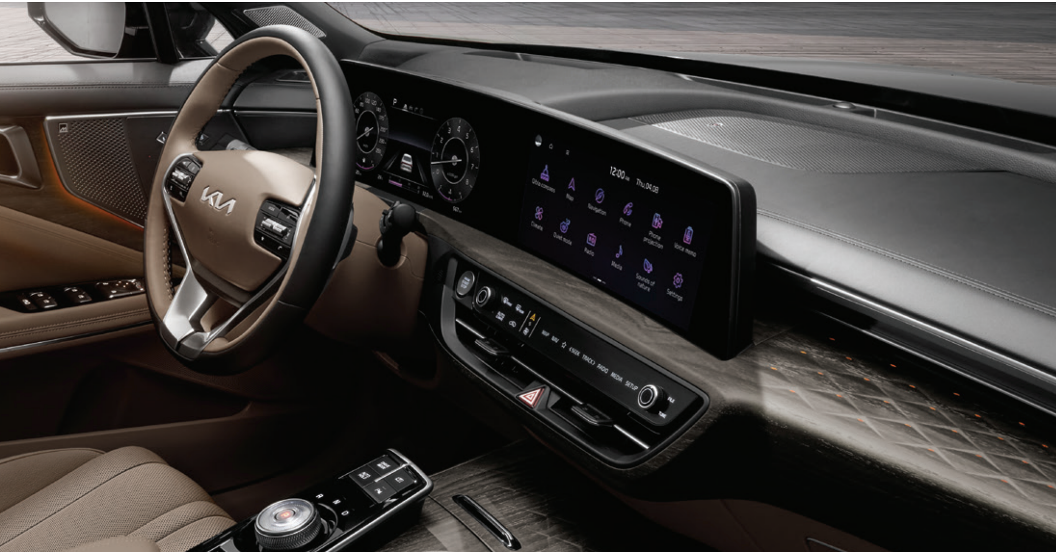
Panoramic curved display