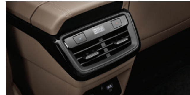
3-zone climate control system (rear seat climate control system)