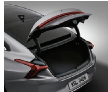
Electric safety power trunk