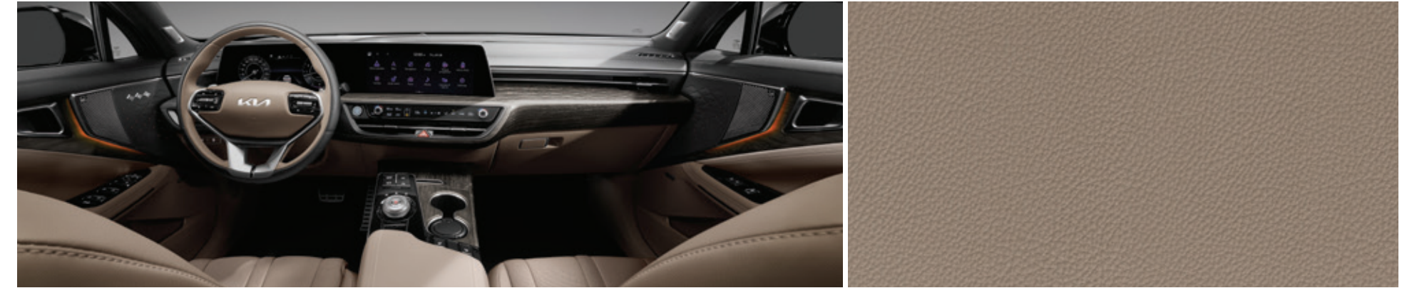
Toffee Brown Two-tone