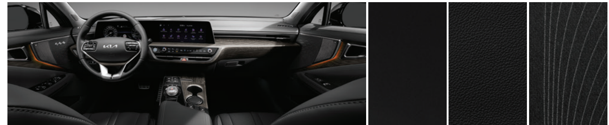
Saturn Black One-tone