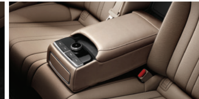
Rear seat armrest