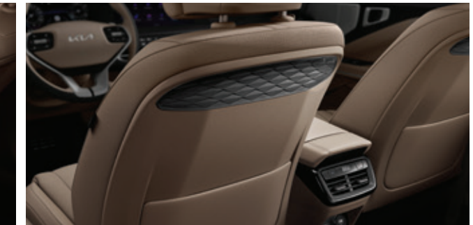
Seatback pocket (board type)