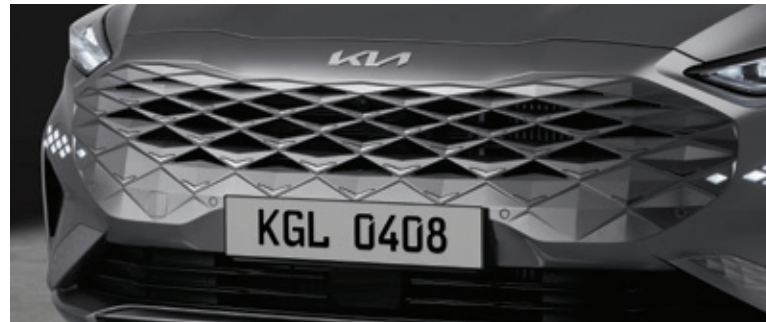
Bumper-integrated radiator grille