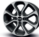
16" Alloys (195/45R16)