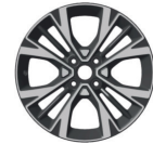
16" Alloys (195/45R16)

Images and colours shown are for illustrative purposes only and may not be to UK specification. All information and illustrations are based on data available at the time of print (October 2022) and are subject to change without notice. Contact your local Kia dealer for current information.