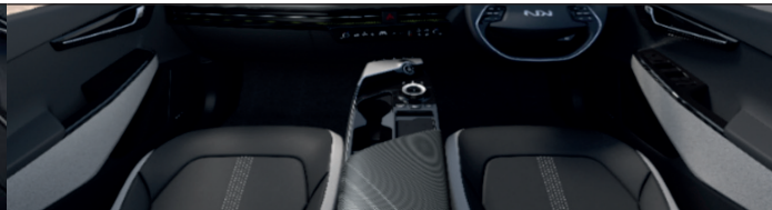
Black Suede and White Vegan Leather