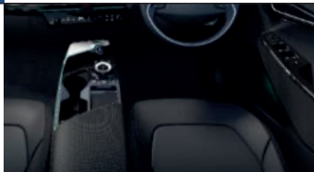
Black Vegan Leather