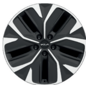
19" Alloy Wheels - Grey