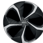
20" Alloy Wheels - Black

Images and colours shown are for illustrative purposes only and may not be to UK specification. All information and illustrations are based on data available at the time of print (August 2022) and are subject to change without notice. Contact your local Kia dealer for current information.