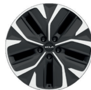
19" Alloy Wheels - Black