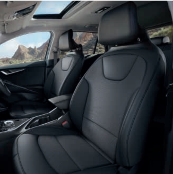
Black Cloth & Artificial Leather Upholstery Hybrid, Plug-in Hybrid and EV)