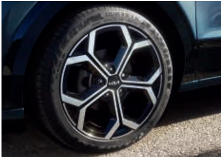
16 or 18-inch alloy wheels. Make it even more personal with specially designed aerodynamic 16-inch or 18-inch alloy wheels, depending on the trim level you choose.