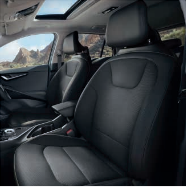
Black Vegan Leather Upholstery (Hybrid, Plug-in Hybrid and EV)