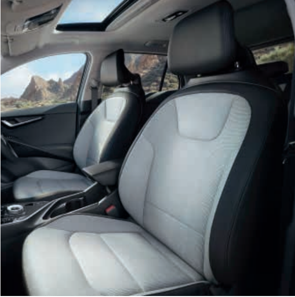
Grey Vegan Leather Upholstery (EV 4 grade only) (Part of Grey Pack)*