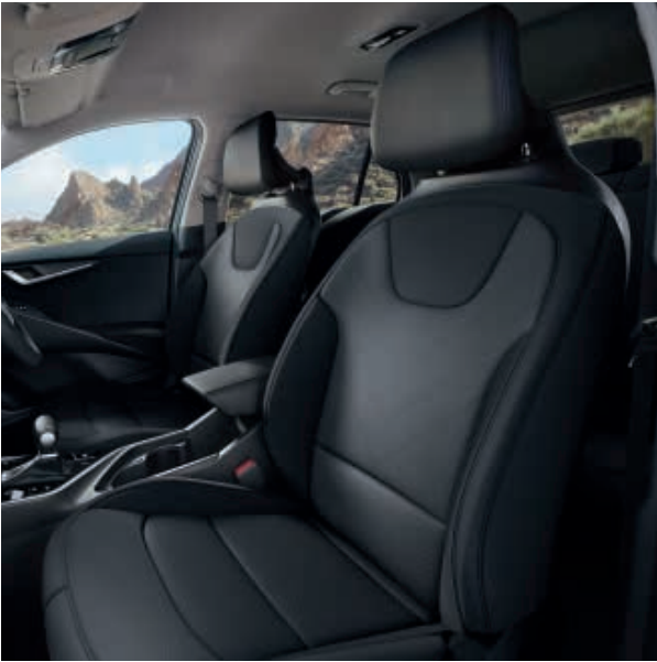
Black Cloth Upholstery (Hybrid, Plug-In Hybrid and EV)

Niro EV Highway Driving Assist 2 makes motorway driving a breeze. When engaged, it automatically adjusts your target speed to the limit in force, helps you keep centred in your lane and modulates your speed based on a safe distance to the vehicle ahead. It also offers a "lane-change-assist" function, which helps you change lane if possible when you indicate.