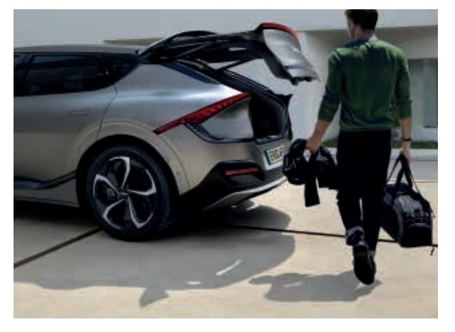
Smart power tailgate. The power tailgate can be set to open automatically to a desired height.

Designing the Kia EV6 based on our new Electric-Global Modular Platform gave us new possibilities, especially when it comes to cargo storage. The Kia EV6 lets you store items in places you never imagined. Under the front bonnet, under the rear cargo floor, under the cargo screen and even in spaces between and under the seats. But in case you need to accommodate even bigger items, the rear seats also fold. Because ideas come in a wide range of sizes.