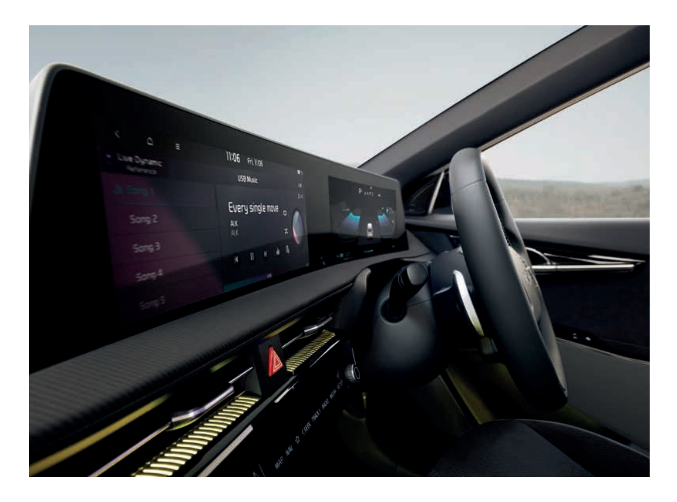
The dual 12.3" panoramic curved displays. The Kia EV6's integrated curved displays are not only beautiful, but offer a truly immersive experience. They enhance the driving experience by providing high-definition navigation and important information, with minimal controls for an unobstructed and easy driving experience.

USB ports on seatbacks. Convenience is important for everyone on board. Rear seat passengers will find USB ports in the seatbacks in front of them, so they can power their devices whenever they want.