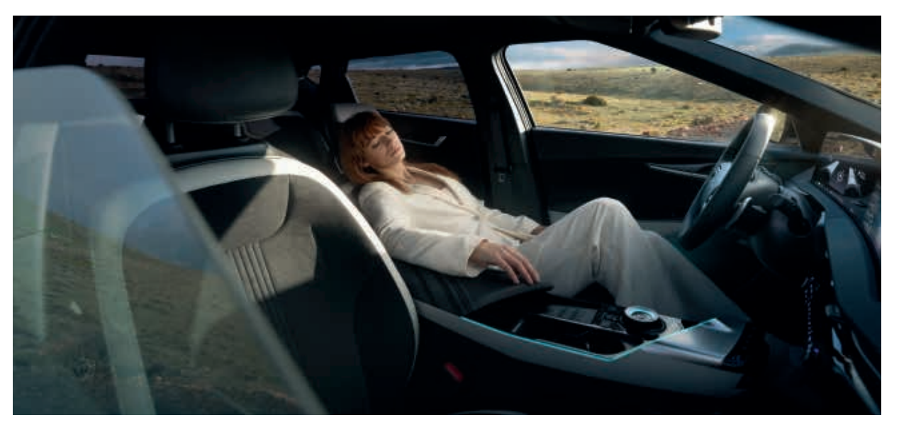
Relaxion comfort seats. The front seats are slimmer, more comfortable and offer more adjustability than ever before. While you charge the Kia EV6, the relaxion seats let you recline to optimise your posture and better distribute the pressure on your body.

With a flat floor and a broad-shouldered frame, the Kia EV6 gave our designers more freedom to create the best design for you. The seats take up less space, but deliver more. The zero-gravity premium relaxion seats provide a wide range of settings so that your body is in its most comfortable position, minimizing the fatigue or discomfort you might have experienced with conventional seats, especially on long drives or when you're waiting for your car to top up its battery. Because when you're more relaxed, ideas flow better (grade dependent).