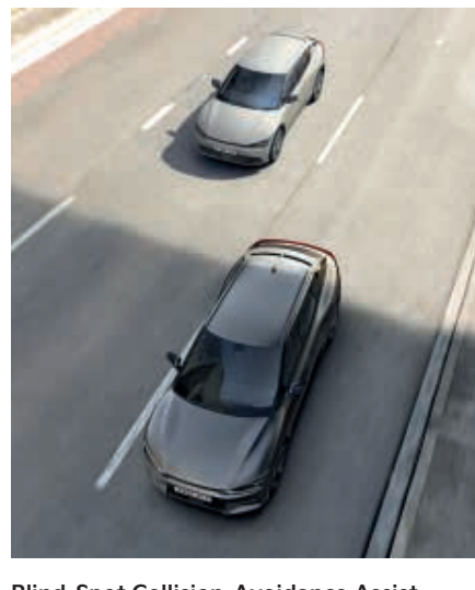
Blind-Spot Collision-Avoidance Assist. When you signal a lane change, you are warned if a risk of collision is detected with a vehicle beside you or approaching from the rear. The system even interacts with your steering if the risk increases. Blind-Spot Collision-Avoidance Assist also watches out for you when pulling out of parallel parking spaces, warning you about oncoming traffic behind you (grade dependent).