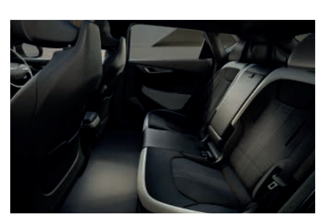
Second-row seat comfort. The slim front seats, the unique E-GMP platform layout and the flat floor give rear passengers more legroom. There are headrests in every position, and a centre armrest incorporates a storage box with sliding cupholder. Air vents on the B-pillars offer refreshing airflow.