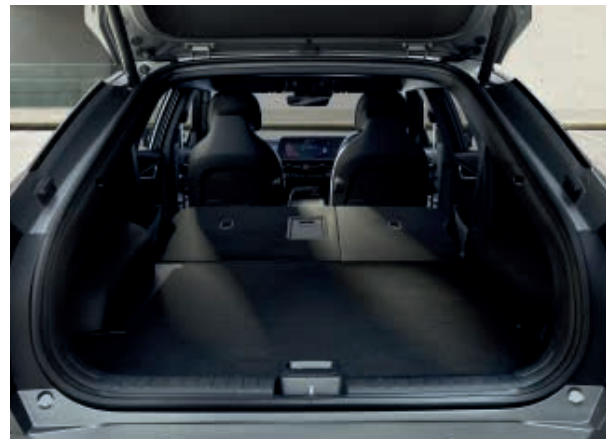
Remote second-row seatback folding. Pull the remote release lever on the wall of the cargo space to fold the rear seatback down, creating 1,300 \ell of storage capacity. With the lever's convenient location, it's like having an extra pair of hands when you need to load long or bulky items.