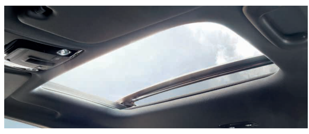
Wide sunroof. Airflow adds to the sense of openness. The roomy dimensions of the Kia EV6 seem to expand with the wide tiltsliding sunroof. It takes full advantage of the roof geometry, offering a broader opening for light and breezes (grade dependent).