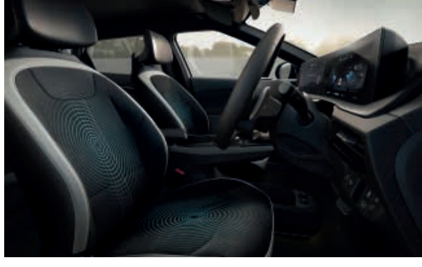
Heated and ventilated seats. Ventilated front seats give the driver and front passenger a more comfortable ride in warm weather. With the centre console touch buttons, both fans and heating can be controlled and adjusted to meet the needs of passengers in the front and rear (GT-Line S only).