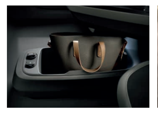
Console tray. The center console includes an armrest, cup-holders, a wireless charging pad above, and an open tray below that can hold shoes, tablets, or handbags (grade dependent).