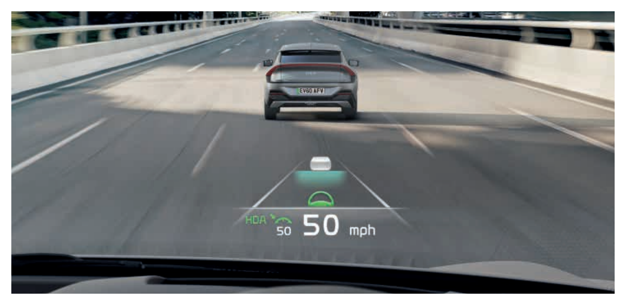
Augmented Reality head-up display. The Kia EV6's head-up display projects driving information on the windscreen. It superimposes turn instructions from the navigation system over the roads ahead, lets you know if you're drifting out of your lane and indicates which vehicle is detected ahead of you (grade dependent).