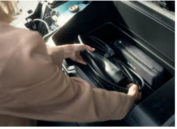
Front storage trunk (20 \ell , 52 \ell ). Extra space is a useful benefit of the new Kia EV6 platform. That includes a convenient storage space under the front bonnet. It holds up to 20 \ell on AWD models and up to 52 \ell on RWD models.