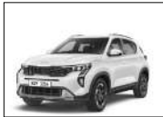
Glacier White Pearl