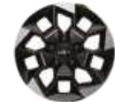
16 Inch DiamondCutting Alloy WheelBlack High Gloss