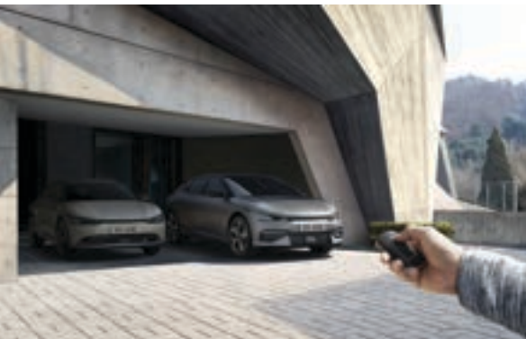
Remote Smart Parking Assist