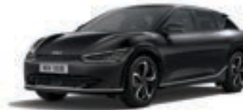
Aurora Black Pearl