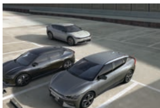
Rear Cross Traffic Collision Avoidance Assist