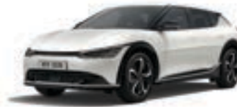
Snow White Pearl