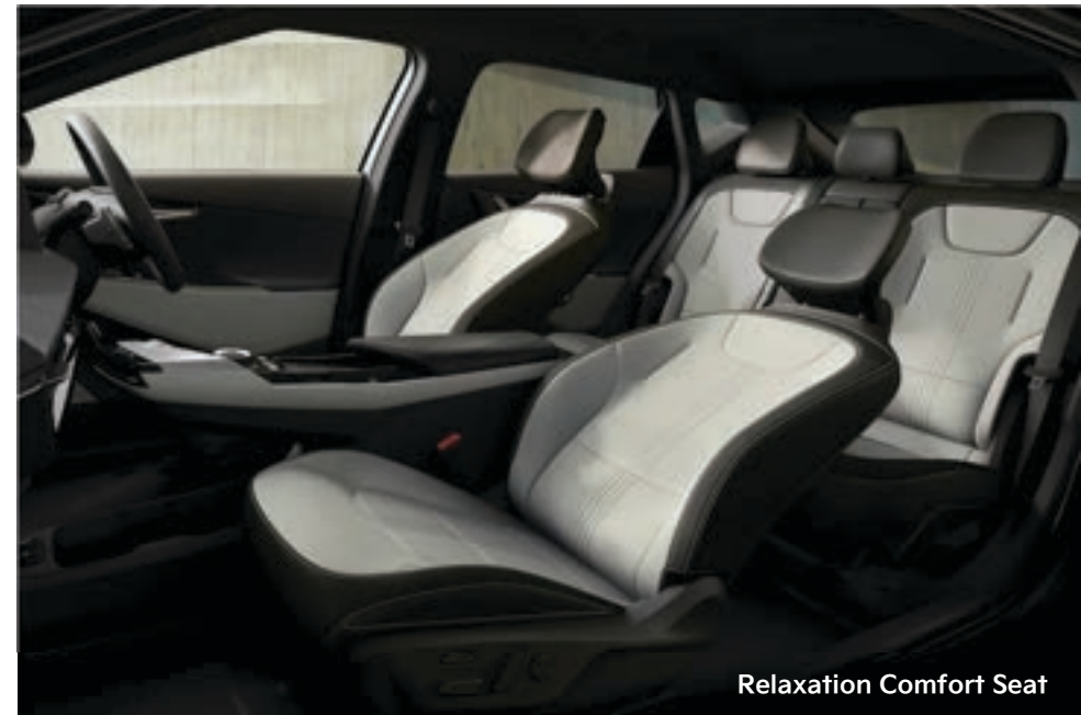
Relaxation Comfort Seat