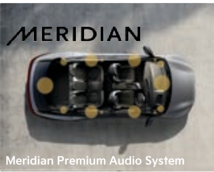
Meridian Premium Audio System