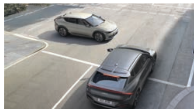
Forward Collision Avoidance Assist