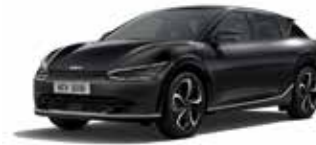
Aurora Black Pearl

PT. Kreta Indo Artha memiliki hak paten untuk memodifikasi model termasuk karakteristik, spesifikasi, perlengkapan, dan aksesoris. Materi dan foto hanya bertujuan memberikan gambaran terhadap produk. Bukan sebagai ketentuan pasti.