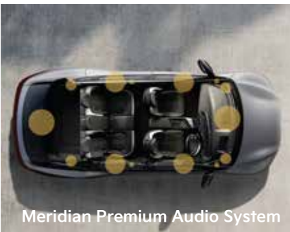
Meridian Premium Audio System