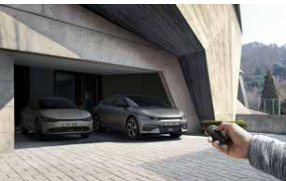
Remote Smart Parking Assist