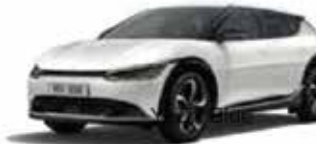
Snow White Pearl