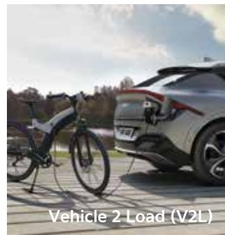
Vehicle 2 Load (V2L)