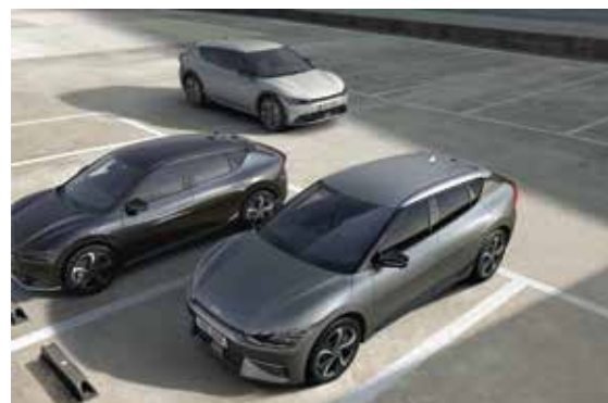
Rear Cross Traffic Collision Avoidance Assist