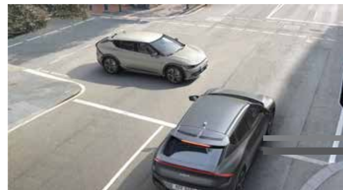
Forward Collision Avoidance Assist