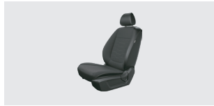
Black Interiors with Premium Fabric