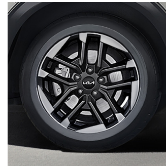
R17 Crystal Cut Dual Tone Alloy Wheels