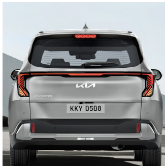
Star Map LED Connected Tail Lamps