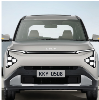
Digital Tiger Face with Diamond Finish Decor