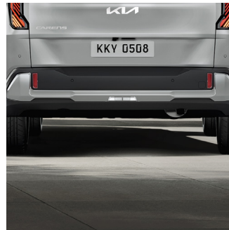
Robust Front & Rear Skid Plates with Silver Paint