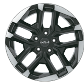
R17 Crystal Cut Dual Tone Alloy Wheels