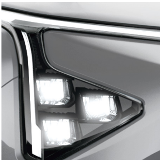
Star Map LED DRLs with Integrated Turn Signal and Ice Cube MFR LED Headlamps

Making your move like no other through Kia's new design language that show up a bold stance, striking LED DRLs up front and sunroof to let the air of your new journey gets through.