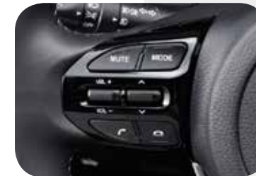
Audio remote control