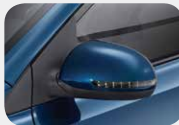
Electric adjustable outside mirrors with LED side repeaters