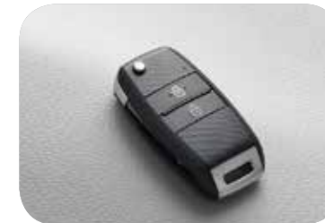
Folding remote key fob