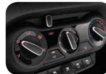
Manual temperature control