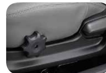
Driver's seat cushion tilt adjuster