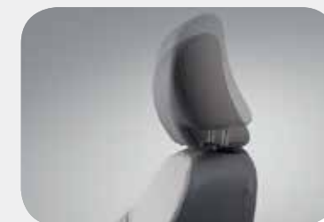
Height adjustable front seat headrest