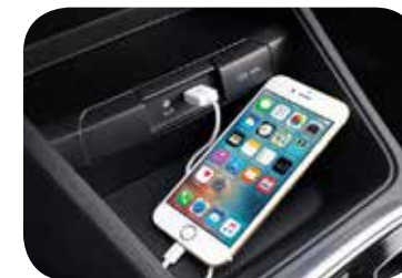
AUX & USB connection with 2-stage tray