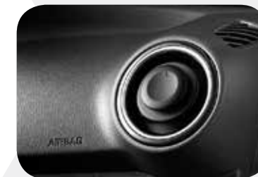
360° rotatable air ducts