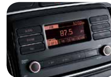
3.8-inch audio display (Optional)