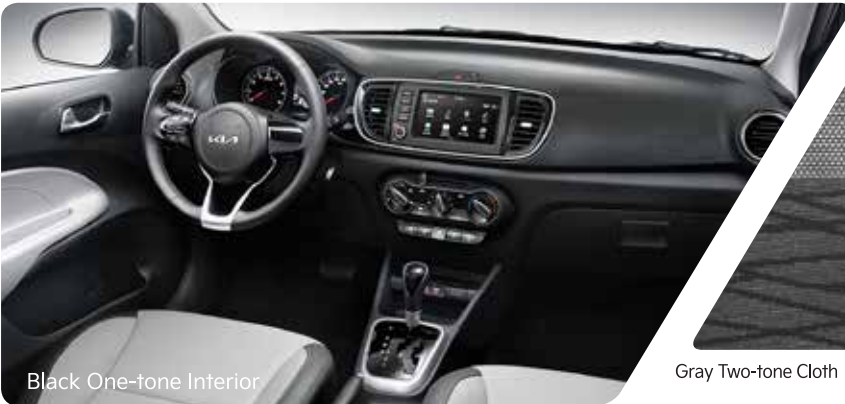
Black One-tone Interior