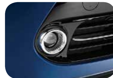
Projection fog lamps