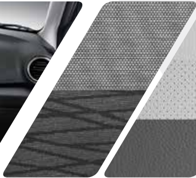
Gray Two-tone Cloth