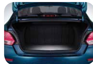
Illuminated luggage compartment (475 L)