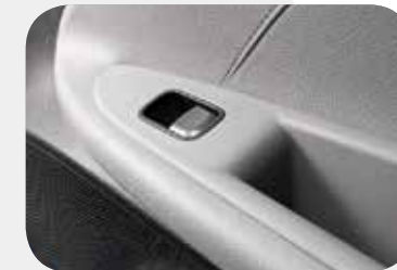
Rear door power windows