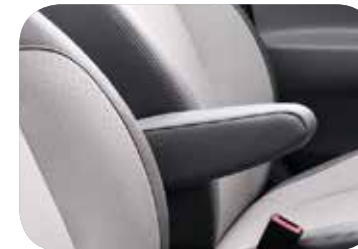
Driver's seat armrest