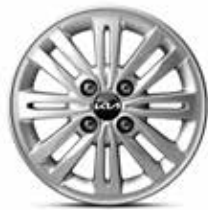
14-inch Alloy Wheel