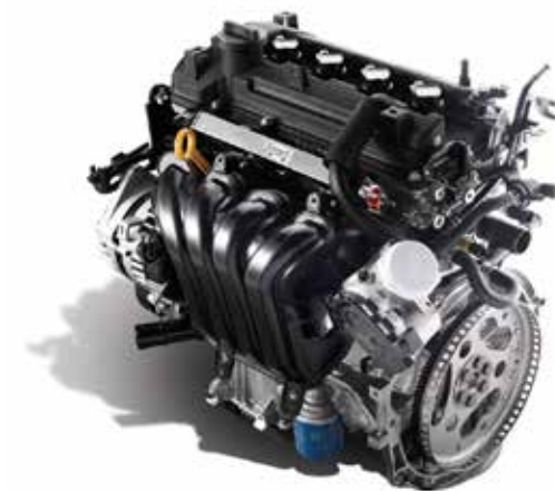
1.4 MPI Gasoline Engine Max. power: 95 ps / 6,000 rpm Max. torque: 13.5 kg.m / 4,000 rpm