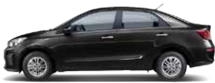
Aurora Black Pearl