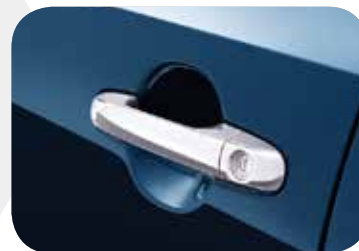
Chrome outside door handles