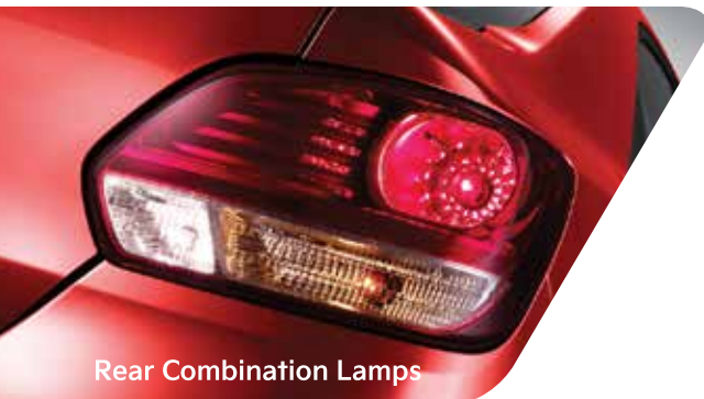
Rear Combination Lamps