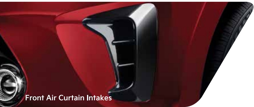
Front Air Curtain Intakes