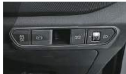
Electric Parking Brake with Auto Hold