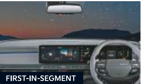
Connected Car Navigation Cockpit