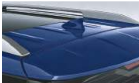
Shark Fin Antenna and Integrated Spoiler