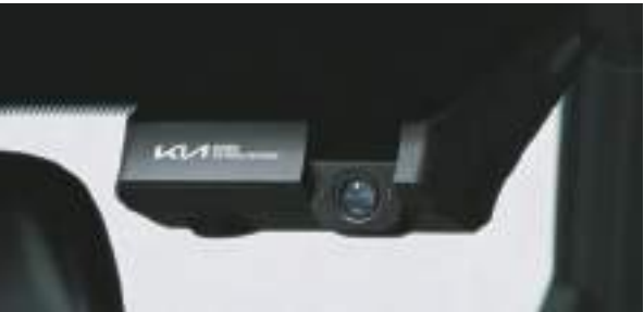
Smart Dashcam with Dual Camera (with Mobile App)