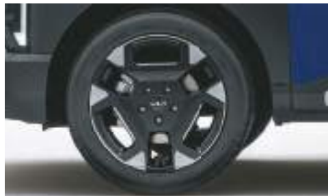
R17 - 43.66 cm (17") Crystal Cut Alloy Wheels