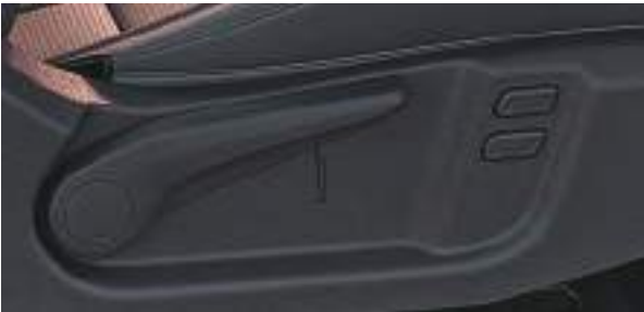
4-way Power Driver Seat