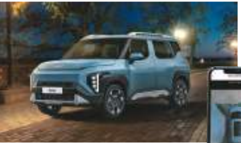
Find My Car with Surround View Monitor