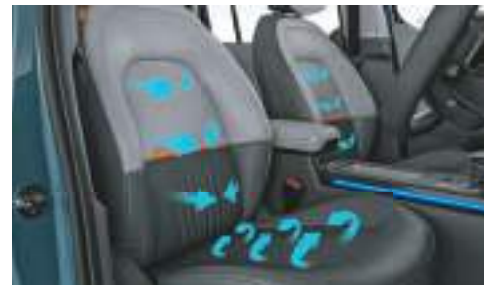
1 st Row Seat Ventilation

To simply stand out is not enough. So, the new Kia Syros is here to be outstanding. A unique SUV that combines a low floor along with a long wheelbase. Inside, everything from the materials and textures to the 76.20 cm (30") Trinity Panoramic Display Panel are edgy and futuristic. The cabin feels luxurious, substantial and uncluttered, offering ample headroom, shoulder room and legroom for your utmost comfort. The rear seat with ventilation and recline and slide function, is the epitome of comfort and flexibility. Every detail in the new Syros is crafted to enhance your experience, making every journey not just a drive, but a step into the future.