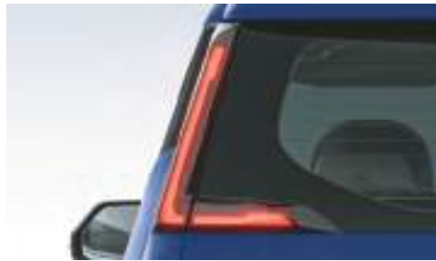
Starmap LED Tail Lamps