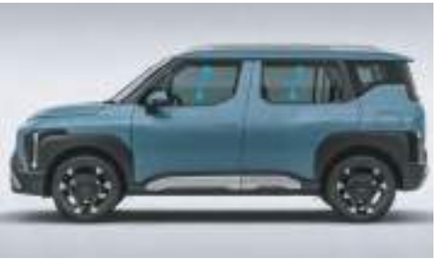
Voice Controlled Window Function