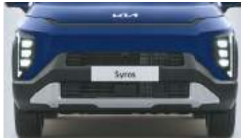
Kia Signature Digital Tiger Face