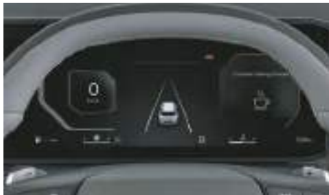
Driver Attention Warning (DAW)