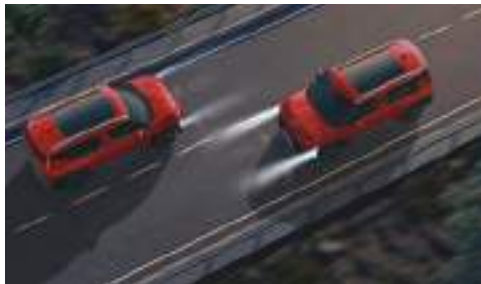
High Beam Assist (HBA)