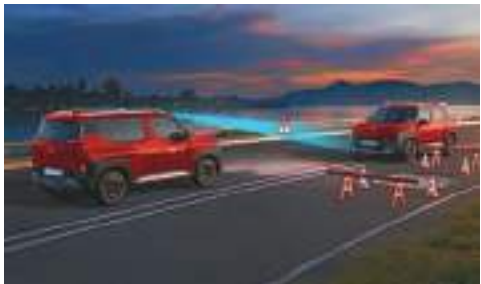
Forward Collision Avoidance Assist - Direct Oncoming (FCA-DO)