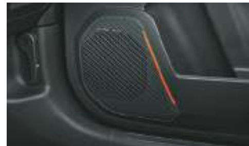
Harman Kardon Premium 8 Speakers Sound System

2 nd Row Seat Recline & Sliding with Seat Ventilation (Seat only)