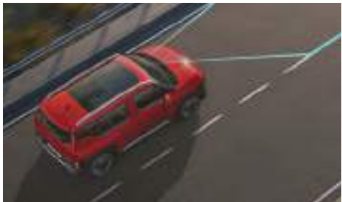
Lane Keep Assist (LKA)