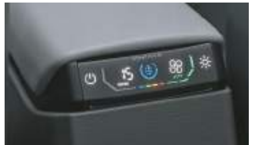
Smart Air Purifier with AQI Display