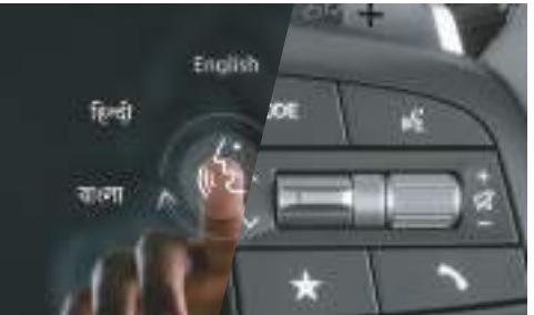
Multilingual VR Commands