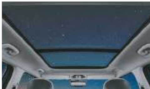
Dual Pane Panoramic Sunroof