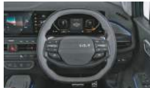
Double D-cut Steering Wheel

76.20cm (30") Wide Trinity Panoramic Display Panel