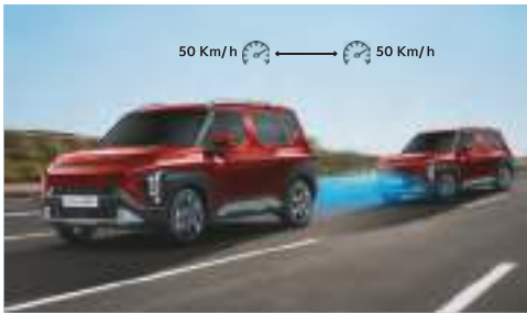
Smart Cruise Control (SCC) with Stop & Go