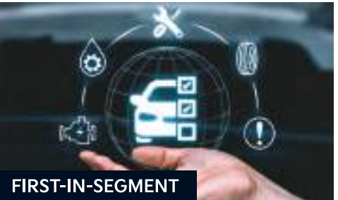
Kia Connect Diagnosis