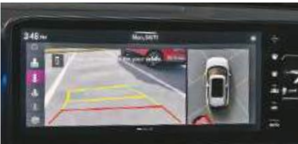
360 Degree Camera