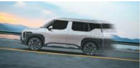
Electronic Stability Control (ESC), Hill Assist Control (HAC) & Vehicle Stability Management (VSM)