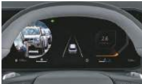
Blind View Monitor in Cluster (BVM)