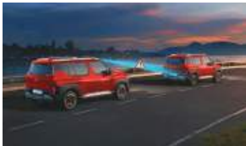
Forward Collision Warning and Avoidance Assist (FCW & FCA)