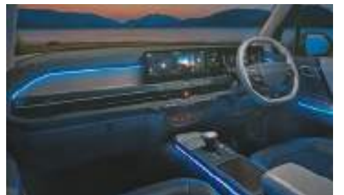
64 Colour Ambient Mood Lighting