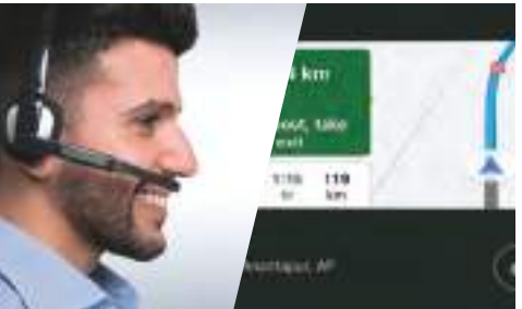
Call Centre Assisted Navigation