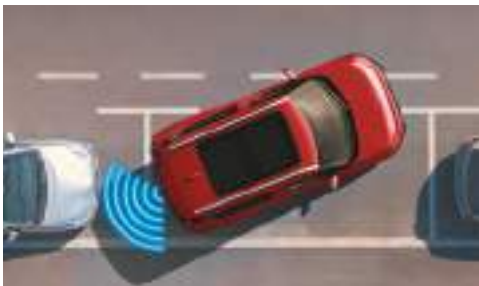
Parking Collision Avoidance Assist - Reverse (PCA-R)