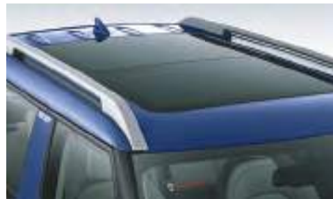
Bold Bridge Type Roof Rails