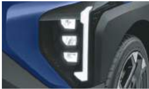
Ice Cube MFR LED Headlamps with Starmap LED DRLs