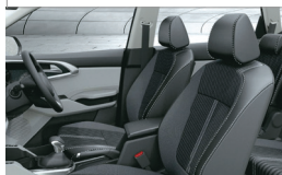
Prestige Plus and Prestige

Opulent Two-tone Triton Navy & Beige Interiors