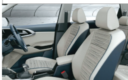
Luxury Plus and Luxury

Xclusive Two-tone Black and Splendid Sage Green Interiors