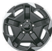
R16 - 40.56 cm (16") Styled Steel Wheels