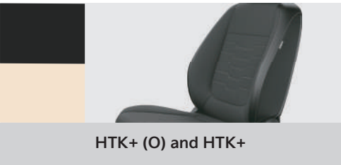
Black & Beige Two-Tone Interiors with Premium Fabric and Leatherette Combi Seats (Black) & Dark Metal Paint Dashboard with Black Metal Garnish