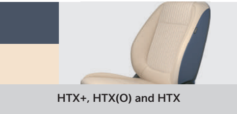
Triton Navy & Beige Two-Tone Interiors with Beige & Navy Leatherette Seats & Opulent Dashboard Garnish and Pad Print