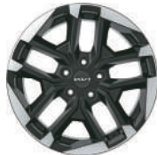
R17 - 43.66 cm (17") Crystal Cut Dual Tone Alloy Wheels