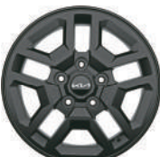
R15 - 38.02 cm (15") Glossy Black Alloy Wheels