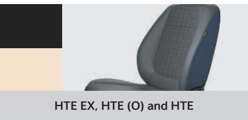
Black & Beige Two-Tone Interiors with Black & Navy Semi-Leatherette Seats & Indigo Metal Paint Dashboard with Black Metal Garnish