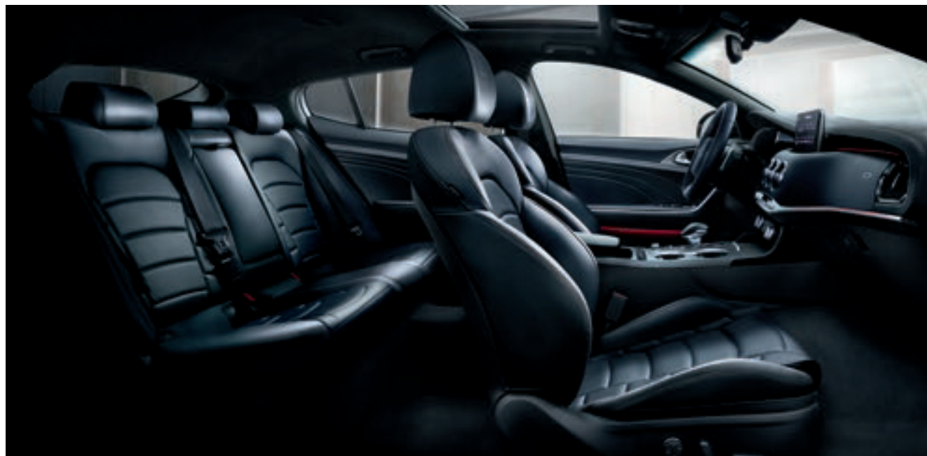
Nappa Leather Seat Trim*