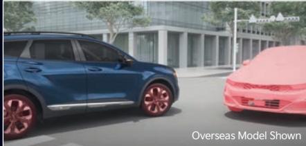
Overseas Model Shown Autonomous Emergency Braking 1 (with Junction Assist)