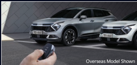
Overseas Model Shown Remote Smart Park Assist 3 (GT-Line Diesel)