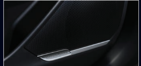
8 Speaker Harman Kardon Premium Sound System (SX+, GT-Line)