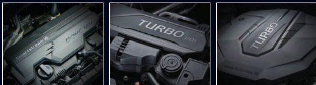
115kW 2.0L Petrol (S, SX & SX+) 132kW 1.6L Turbo Petrol (SX+ & GT-Line) 137kW 2.0L Turbo Diesel (S, SX, SX+ & GT-Line)