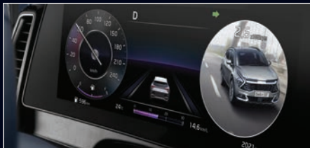
Blind Spot View Monitor 1 (GT-Line)