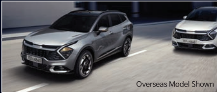
Overseas Model Shown Blind Spot Collision Avoidance Assist with Rear Cross Traffic Collision Avoidance 1 (Not Available on M/T)