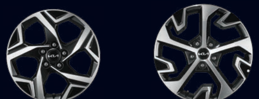
17" Alloy (S) 18" Alloy (SX)