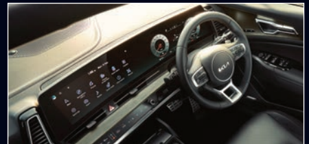
Curved Display (12.3" Digital Driver Cluster + 12.3" Touch Screen Infotainment) (GT-Line)