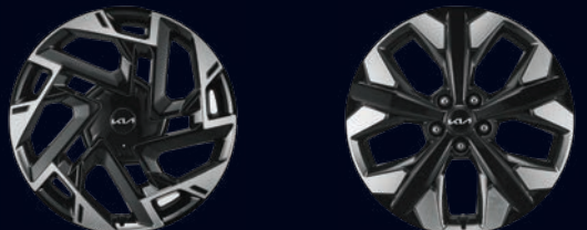
19" Alloy (SX+) 19" Alloy (GT-Line)