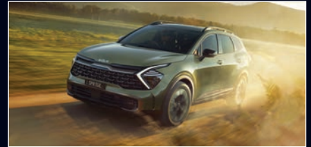
Tuned for Australian Roads