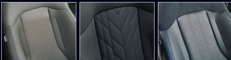
Black Cloth Trim (S, SX) Black Quilted Artificial Leather (SX+) Black Leather Appointed 5 with Artificial Suede Upper (GT-Line)