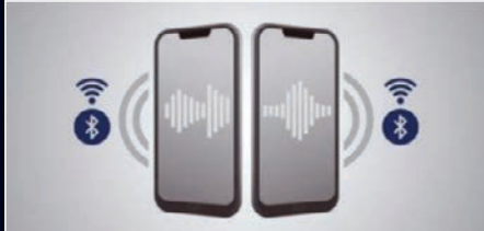
Bluetooth ® Multi-Connection Functionality 2